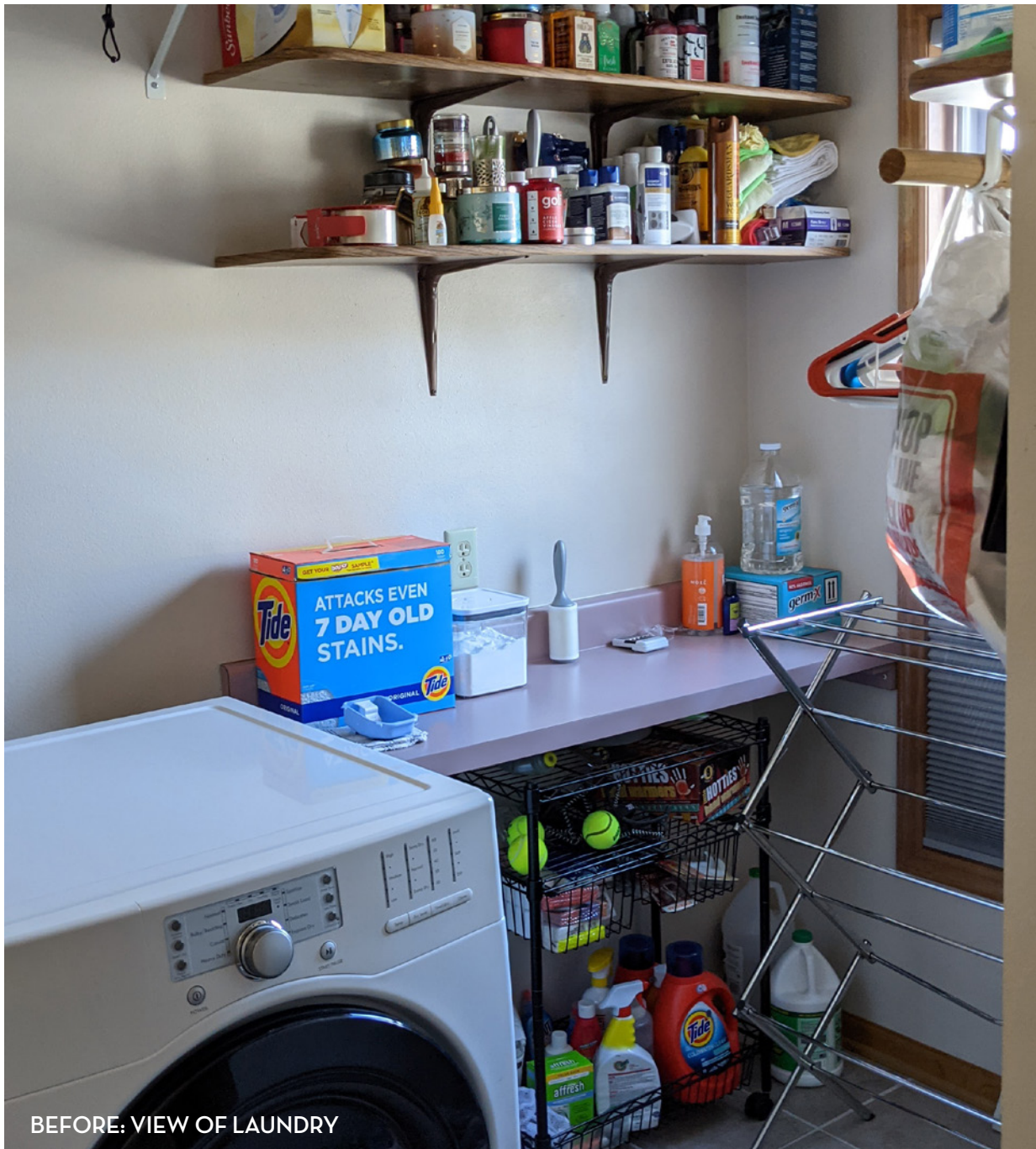
BEFORE: VIEW OF LAUNDRY