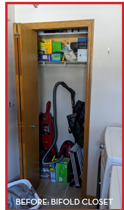
BEFORE: BIFOLD CLOSET

A pocket door (not shown), bifold door, and two walls of the closet were removed. Now, in place of the closet sits a customized bench with shoe cubbies, coat hanging space, and cabinet doors to store away gloves, hats and other seasonal items.