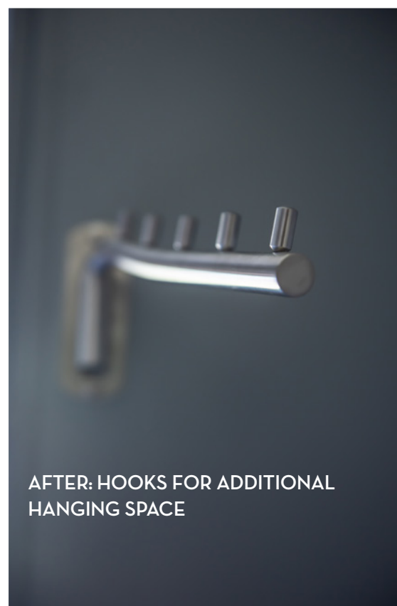
AFTER: HOOKS FOR ADDITIONAL HANGING SPACE