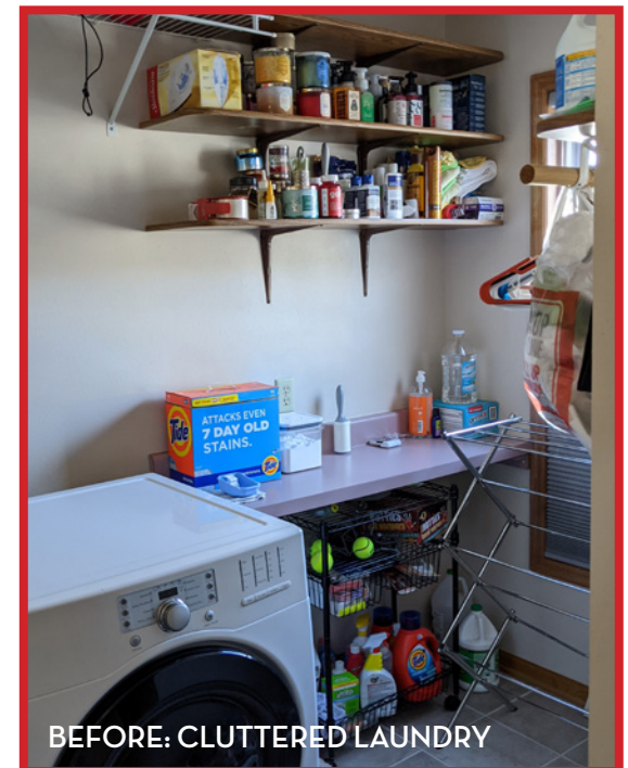
BEFORE: CLUTTERED LAUNDRY

The solution was to open the laundry room to the hallway, and make it something beautiful so that even when you walk by the laundry room to reach the powder room, it is more of statement piece, rather than a cluttered mess.