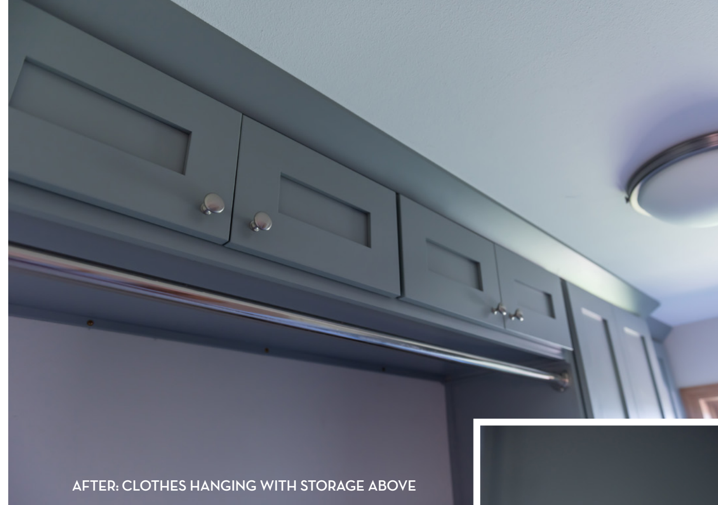
AFTER: CLOTHES HANGING WITH STORAGE ABOVE

The laundry room is now bright and cheerful, with plenty of cabinetry, drawers, pullouts and doors.