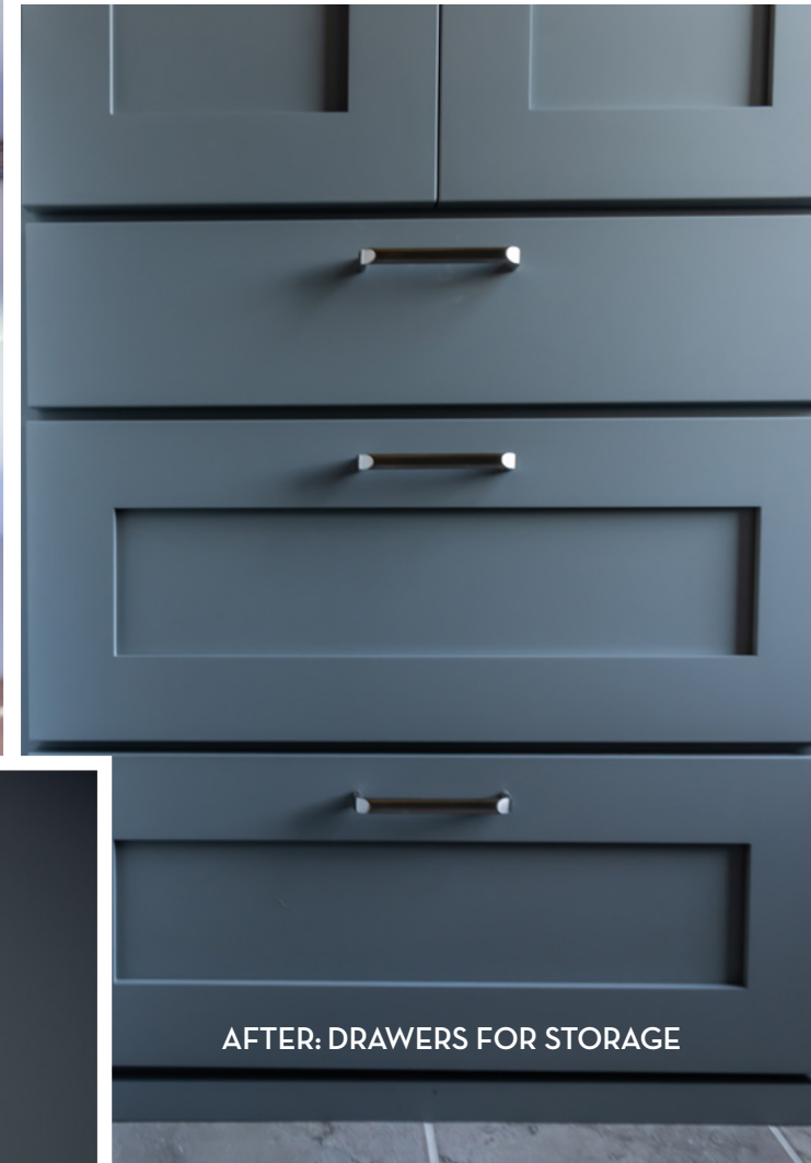
AFTER: DRAWERS FOR STORAGE

The laundry room is now bright and cheerful, with plenty of cabinetry, drawers, pullouts and doors.