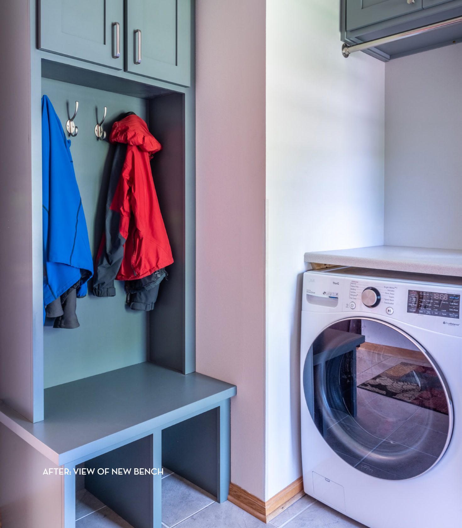
AFTER: VIEW OF NEW BENCH

A pocket door (not shown), bifold door, and two walls of the closet were removed. Now, in place of the closet sits a customized bench with shoe cubbies, coat hanging space, and cabinet doors to store away gloves, hats and other seasonal items.